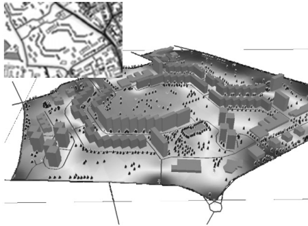
Fig. 2: B. Student generated 3D map with the official noise map in the upper left corner

In Budapest we did not have the official data, so only visual comparisons could be made. It only shows a difference compared to the raster map in case of the highest values of over 80 dB, measured by the student.